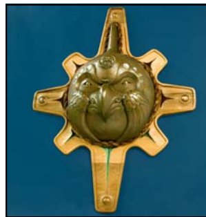
Cast Copper Sun Mask