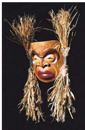
Spirit of the Bear

“My art is a metaphor for my life – as I shape and mold the materials, I exercise my patience, strength and softness. My heart and ears open to the Spirit of Mother Cedar, the Spirit moves.”